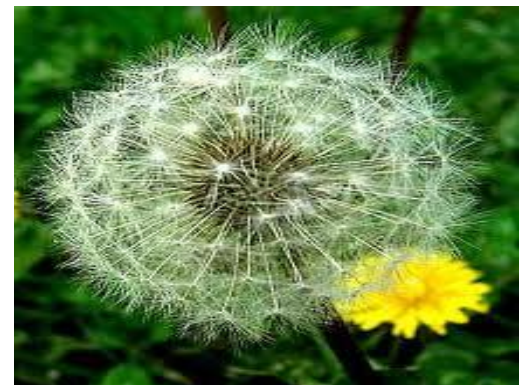
Dandelion to seed head

May is also a time for summer annuals! See more about this service on the top left corner.